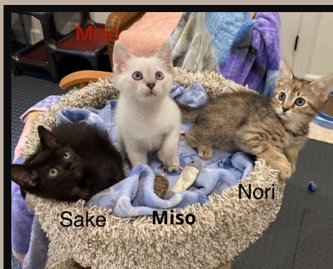
Sake, Miso, and Nori

We had litters of kittens who kept getting upper respiratory infections (URIs) continuously this summer. They had numerous vet visits until they all got well!