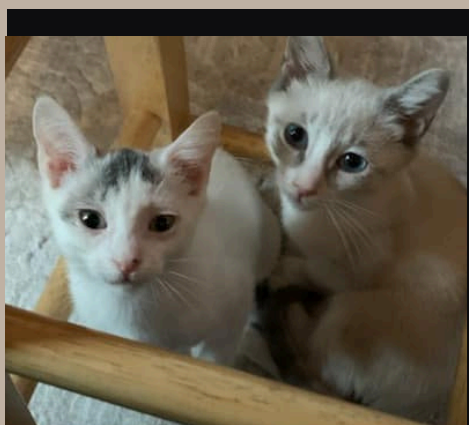
Mandolin & Viola