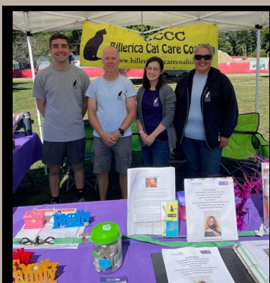
BCCC volunteers at a local farmer's market